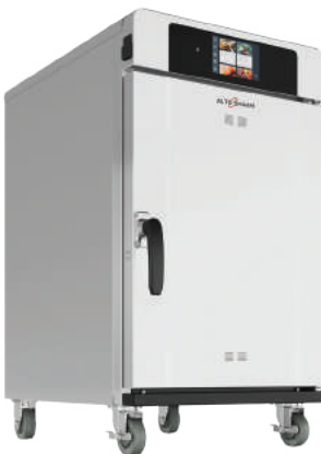
cheflinc enabled Also available with simple control.

MAXIMUM PAN CAPACITY* 5 Full-Size Steam Table Pans, 4" or 8 Full-Size Steam Table Pans, 2-1/2" on wire shelves or