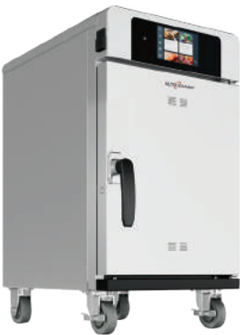
cheflinc enabled Also available with simple control.

MAXIMUM PAN CAPACITY 3 Full-Size Steam Table Pans, 4" or 5 Full-Size Steam Table Pans, 2-1/2"* on wire shelves or