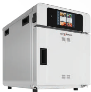
cheflinc enabled Also available with simple control.

MAXIMUM PAN CAPACITY 1 Full-Size Steam Table Pan, 4" or 3 Full-Size Steam Table Pans, 2-1/2" or