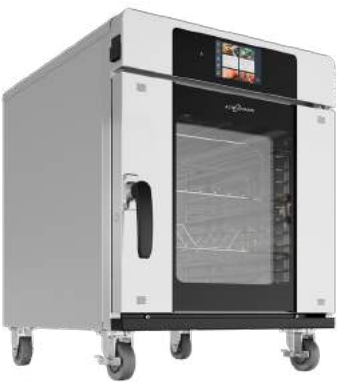
cheflinc enabled Also available with simple control.

MAXIMUM PAN CAPACITY* 6 Full-Size Steam Table Pans, 4" or 10 Full-Size Steam Table Pans, 2-1/2" on wire shelves or